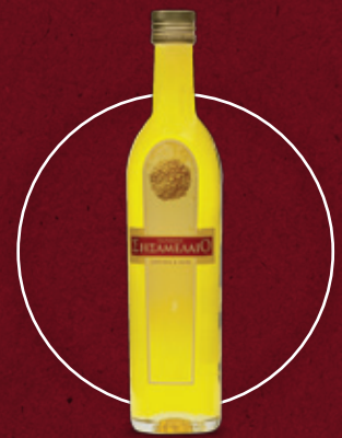
500ML Aromatica bottle