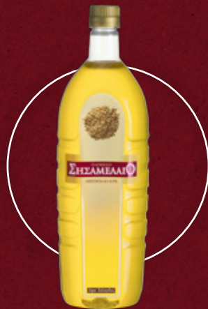
1L PET plastic bottle