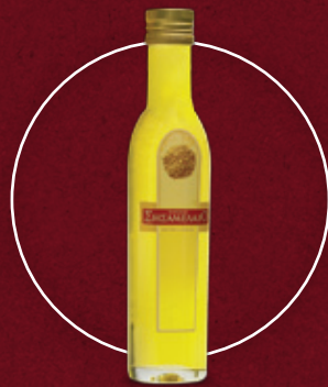
250ML Aromatica bottle