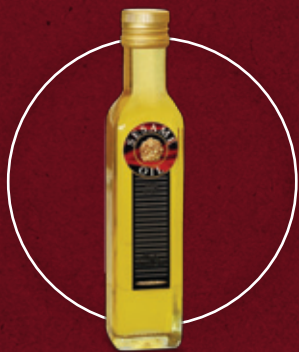
250ML Marasca bottle