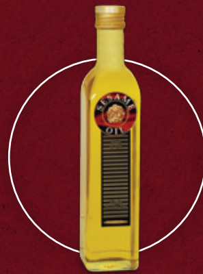
500ML Marasca bottle