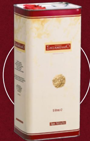
3L, 5L Metal tin